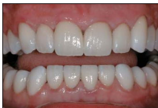
Figure 22. Two-week postoperative view of the patient's smile reveals the optimal shade match and aesthetics.

The final composite and cement shades were determined (Figure 13), and all teeth were prepared for subopaquing (Figure 14). The preparations were cleaned with a chlorhexidine scrub and rinsed. Rubber dam isolation was achieved, and the restorations were then conditioned with 35% phosphoric acid for 1 minute. After