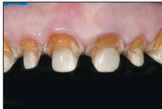
Figure 14. After final composite and cement shades were determined, the teeth were prepared for subopaquing.