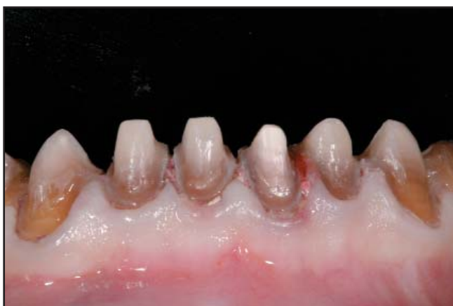
Figure 5. Facial view of the completed mandibular anterior preparations. The preparations should be cleansed and left slightly moist.