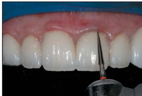
Figure 20. Once excess cement was removed, the margins were polished.