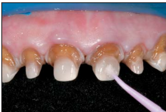
Figure 16. The single-component bonding agent was applied to the prepared dentition.