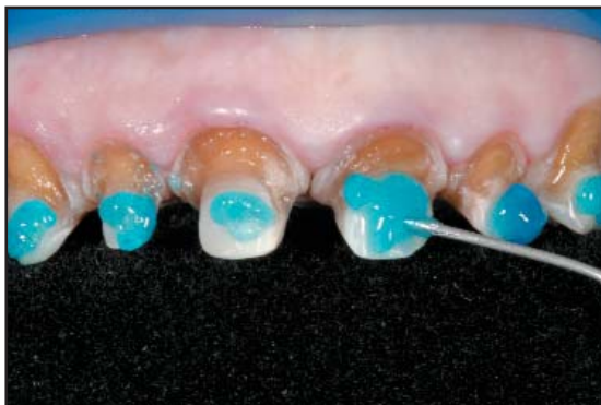
Figure 15. The tooth preparations were etched with 35% phosphoric acid.