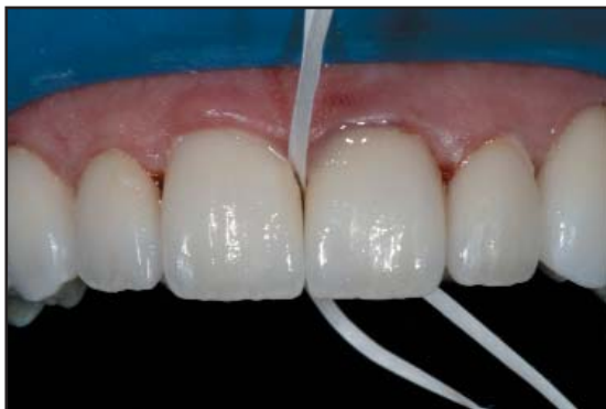
Figure 19. The restorations were flossed in order to remove interproximal residual cement.