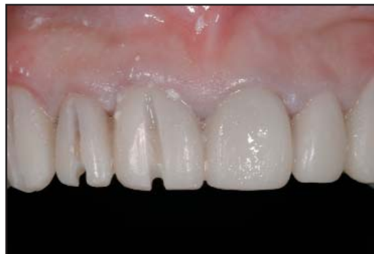
Figure 8. The provisional restorations were removed by imparting a slit down the center of the acrylic.

correction through the restorative process were identified (Figures 1 and 2). Gingival height and symmetry were also evaluated.