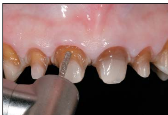
Figure 10. A coarse diamond bur was used to cut away the banding and create a 1-mm subgingival trough.

The patient was anesthetized and the maxillary and mandibular teeth were overlaid with a provisional acrylic using the putty matrices of the wax prototype. Depth cuts were placed in the facial surfaces of the maxillary anterior and premolar teeth with a 0.7-mm depth cutter. Incisal and proximal depth cuts of 1.5 mm and 1 mm,