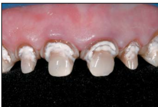
Figure 17. The opaquer composite and a red tint were mixed and applied to the depth of the trough.

Mandibular provisional restorations were also created similarly. The teeth were dried, and a desensitizing agent was painted on the teeth and lightly dried. The provisional acrylic remained on the teeth for 2 minutes, and then the matrix was gently removed. Once the margins were trimmed, the