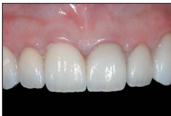
Figure 12. Half of the teeth were tried in with try-in paste, the others with paste only.