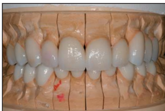
Figure 13. View of the definitive metal-free restorations on the working model.

respectively, were created with a supercoarse chamfer bur. This bur was also used to scribe the facial margins 1 mm supragingivally.