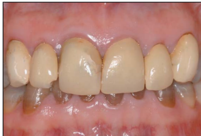
Figure 1. A 37-year-old female patient presented with concerns regarding her Class I occlusion and tetracycline-stained dentition.

With the conventional subopaquing technique, one of the challenges encountered is placing acrylic provisional restorations. The acrylic provisionals tend to adhere to the composite resin, often making their removal challenging during the final seating appointment. Additionally, the composite is abraded at the seating appointment and silanated to couple the exposed glass particles in the composite prior to the placement of the