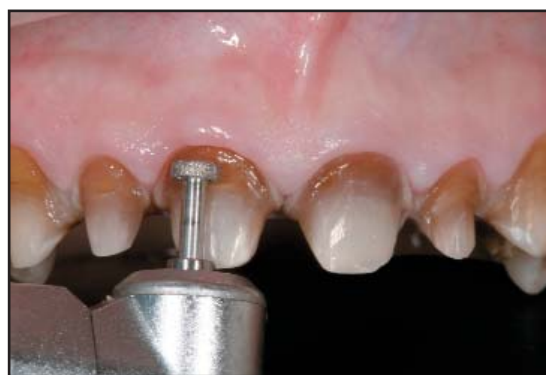
Figure 9. To accommodate the composite necessary to subopaque the veneers, a 0.5-mm depth cutter was used.

The shade of the existing teeth were observed in natural light and photographed (eg, Canon 20D, Canon Inc., Lake Success, NY; Nikon D70, Nikon Corp., Melville, NY) using the shade tabs as references, and using a colorimeter system (eg, ShadeVision, X-Rite, Grandville, MI; EasyShade, Vident, Brea, CA). Next, the putty matrices and reduction guides were tried in to verify fit.