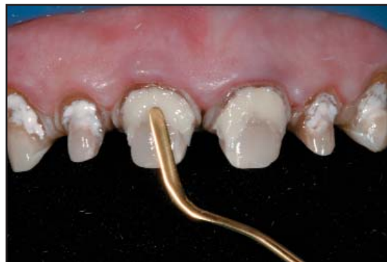
Figure 18. A microhybrid composite was added and filled almost to the level of the preparation.

Mandibular provisional restorations were also created similarly. The teeth were dried, and a desensitizing agent was painted on the teeth and lightly dried. The provisional acrylic remained on the teeth for 2 minutes, and then the matrix was gently removed. Once the margins were trimmed, the