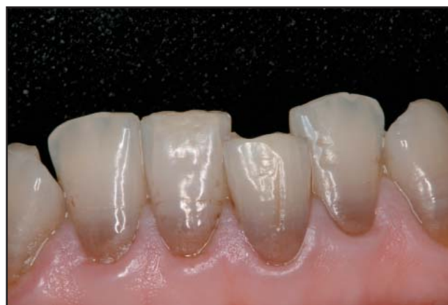
Figure 2. Moderate crowding was noted, but not crossbites. Canine guidance and contact in protrusive movements were present.