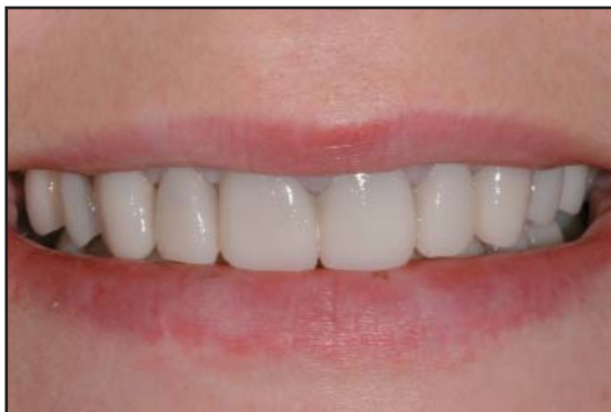
Figure 7. Facial view of the patient's smile with provisional restorations in place.