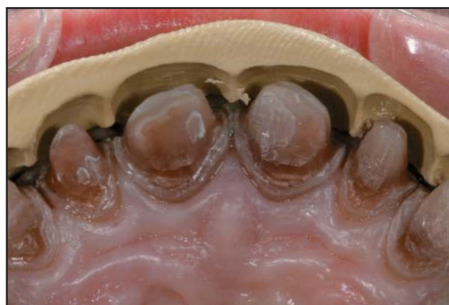
Figure 3. View of polyvinylsiloxane putty reduction matrix. Preparations were used to verify adequate incisal and proximal reduction.