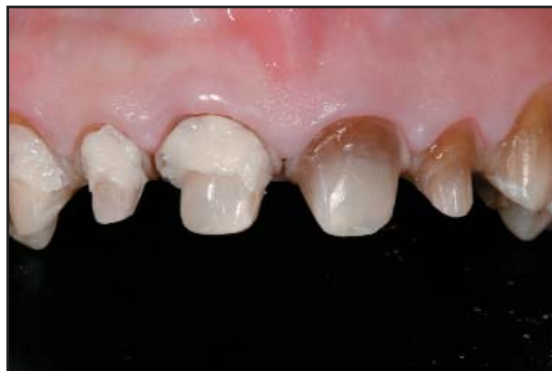
Figure 11. An opaque microhybrid composite was tried-in to the hollowed out area.