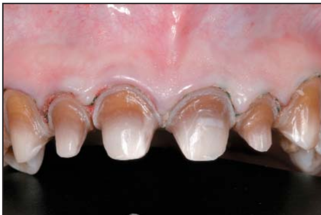
Figure 4. View of the completed maxillary anterior preparations with retraction cord in place.